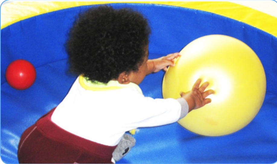
Epiphany Parent-Child Center

As you enter the Epiphany Center you're likely to hear the sounds of children playing in the courtyard or toddlers walking hand-in-hand down the hallway. The sounds of children warm your heart and remind us of our purpose: to help them be the best they can be.